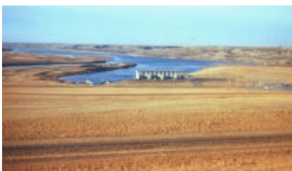
Lake Diefenbaker's Unrealized Potential