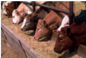
Feedlot Investments Supported by Irrigated Feeds

The study evaluated the economic impact of adding hundreds of thousands of new irrigated acreage in all regions of the province to provide the foundation for on-farm investment in irrigation equipment and off-farm investment in value added processing activities. The off-farm building blocks for a transformation agricultural economy included both forward-linked on and off-farm value added activities. As development and investment in the region grows, crop mixes changes and incomes rise.