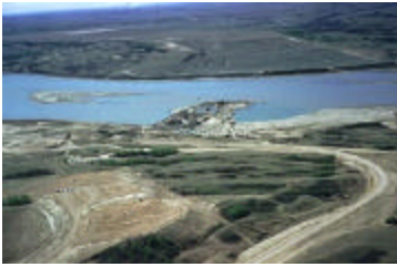
Lake Diefenbaker Construction in the 1960s