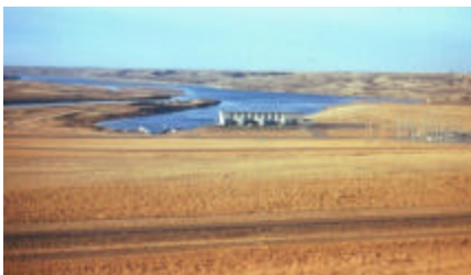
Lake Diefenbaker's Unrealized Potential